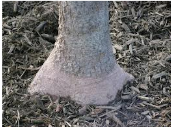
Root flare correctly placed above soil

Get Lead Planter's approval before filling hole