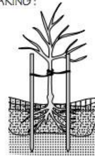
Proper staking of a bare root tree